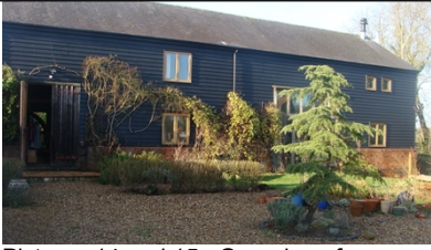
Pictures 14 and 15. Grouping of converted barns to east of Coltsfoot Farm of architectural and historic worth. These have been converted.