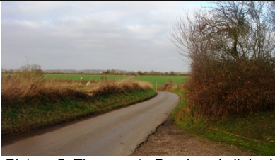
Picture 5. The area to Bandons is linked by road appearing as open countryside.