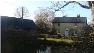
Picture 18. Pleasant complex of farmhouse and converted agricultural buildings at Puttocks End.