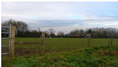
Picture 11. Open area of horse grazing no longer proposed to be within the CA.