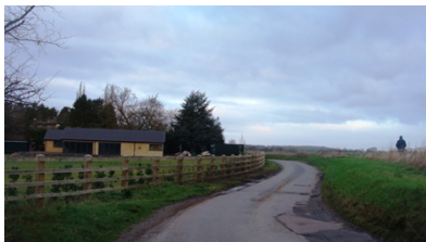
Picture 3. The area is part of open countryside including land on the left of the picture which the PC seeks to reintroduce.

Retain Pains End (Paynes End) within the CA and extend the CA to include Bandons and other properties nearby. Pains End and Bandons area to be linked by CM. Areas 2 and 2 A on attached Appendix Map.