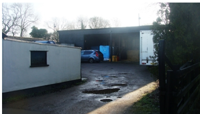
Picture 10. Some of the less attractive buildings at Essex Cottage Farm, now proposed for exclusion from the CA.