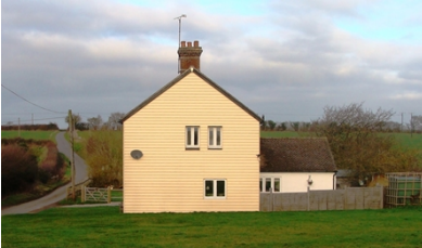
Picture 6. Unlisted property dating from late 19th century whose location appears isolated in the open countryside.