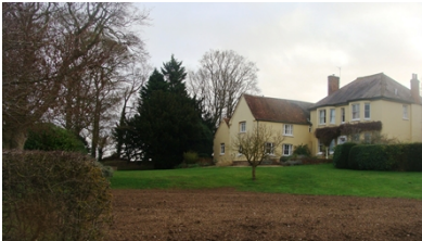
Picture 7. Bandons and any pre 1948 buildings in its curtilage are protected by listed building legislation.