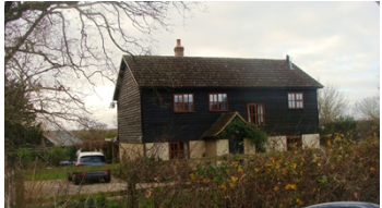
Picture 1. The Grove being of later 20th century date is considered to be of insufficient quality for the CA to be extended to include it.

Proposed eastern extension at Mill Lane to include The Grove and Anstey Grove Barn. Area 1 on attached Appendix Map.