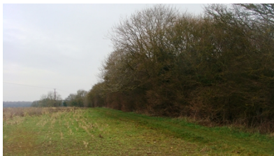
Picture 12. Area consisting of woodland in association with nearby listed properties Welspen Thatch and Dove Cottage is, on reflection, considered to be appropriately retained within the CA. Field to left of picture is open countryside beyond the CA.

General description. The draft Appraisal omitted an extensive area which included this location for reasons set out at Para. 5.55 (d) in the draft document. The numbers of historic listed buildings at Snow End are important to the quality of the CA. (Picture 9). Travelling south east along the north side of the road to Brent Pelham beyond the above group of listed buildings, development consists of Essex Cottage Farm buildings (of limited architectural or historic merit, Picture 10), Yew Tree Cottage (Modern), 1/2 Dawes Cottages (thatched but altered, non listed) - various spellings of these properties noted; The Old Bell (listed) and The Mayflower (modern and set back from the road).