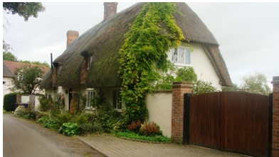
Picture 9. Thatched properties at Snow End represent an appropriate boundary to the CA along the road to Brent Pelham.

Recommendation: It is recommended much of this area continue to be excluded but that Welspen Thatch and adjacent area of woodland and Dove Cottage remain in the CA. See hatched areas on Revised Plans 2 and 3.