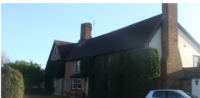
Picture 13. Anstey Bury one of three separately buildings protected by listed building legislation.

Further extension proposed by PC in easterly direction extending along road to Brent Pelham as far as Puttocks End. Areas 3A and 3B on attached Appendix Map.