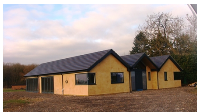
Picture 4. A modern property at Pains End very recently completed of limited architectural and no historical interest.

Include in CA as a 'Conservation Margin'. The PC considers such CM's will protect the countryside beyond.