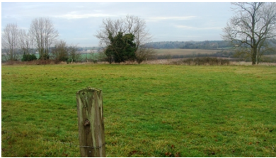
Picture 16. Land to south of Anstey Bury barn and west of Coltsfoot Cottage proposed by the PC to be included in an extended CA.