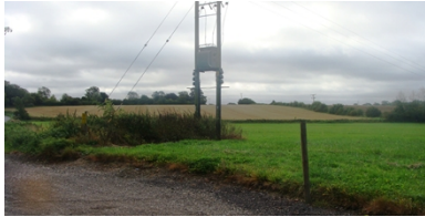
Picture 2. CA controls do not prevent new development in open countryside locations like this.

principally to south side of Mill Lane. Area 1A on attached Appendix Map.