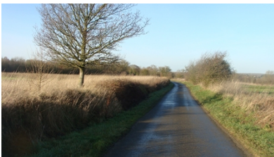
Picture 17. The road link between Anstey Bury and Puttocks End proposed by the PC as a Countryside Margin is partly hedgerow, partly open with intermittent trees.