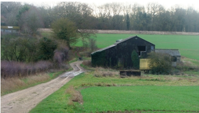
Picture 8. Agricultural land and poor quality modern agricultural barn of no architectural or historic value is clearly part of the open countryside. An application for change of use to residential was refused in 2017.

suggested by the PC) is essentially devoid of vegetation and in the view of the fieldworker forms part of the open countryside (Picture 5).