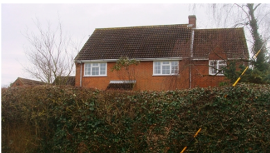
Picture 19. Modern property at Puttocks End of limited architectural or historic interest.

The grouping as proposed by the PC includes some open land which the fieldworker interprets as being part of the open countryside (Picture 16).